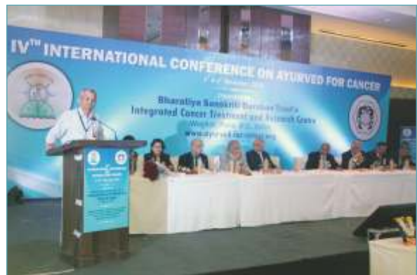
4 th International Conference - 2012

Participation in International Conference 9th SIO, Albuquerque, New Mexico, USA