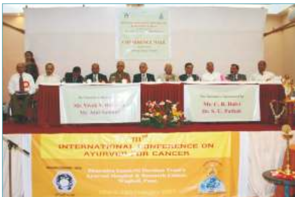
3 rd International Conference - 2007