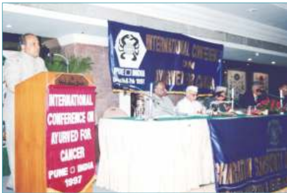
1 st International Conference - 1997

International conferences on “ Ayurved for Cancer ” are held which are attended by many Ayurvedic and Allopathic experts from India and abroad every five years since 1997. Research papers of Integrated Cancer Treatment and Research Centre are presented in the conference. These conferences have proved to be common arena for bringing research on cancer in various pathies to be shared for betterment of Cancer patients.