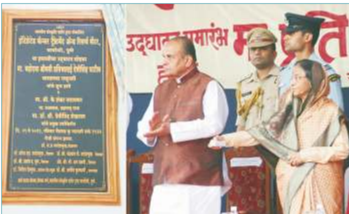
← Inauguration of Integrated Cancer Treatment & Research Centre by Hon. President of India, Smt. Pratibhatai Devisingh Patil