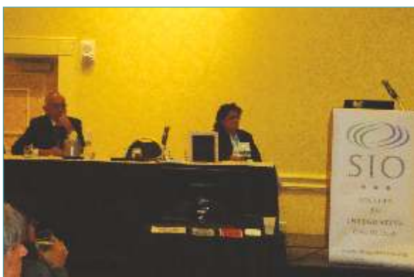
Presentation of workshop on Results of Ayurvedic Treatment in Cancer patients

Participation in International Conference 9th SIO, Albuquerque, New Mexico, USA