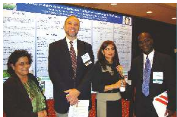
Visit of NCI - OCCAM Staff to Poster Presentation on Management of Radiotherapy side effects with Ayurvedic Treatment in Oral Cancers