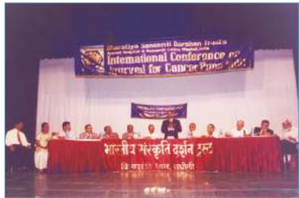
2 nd International Conference - 2002